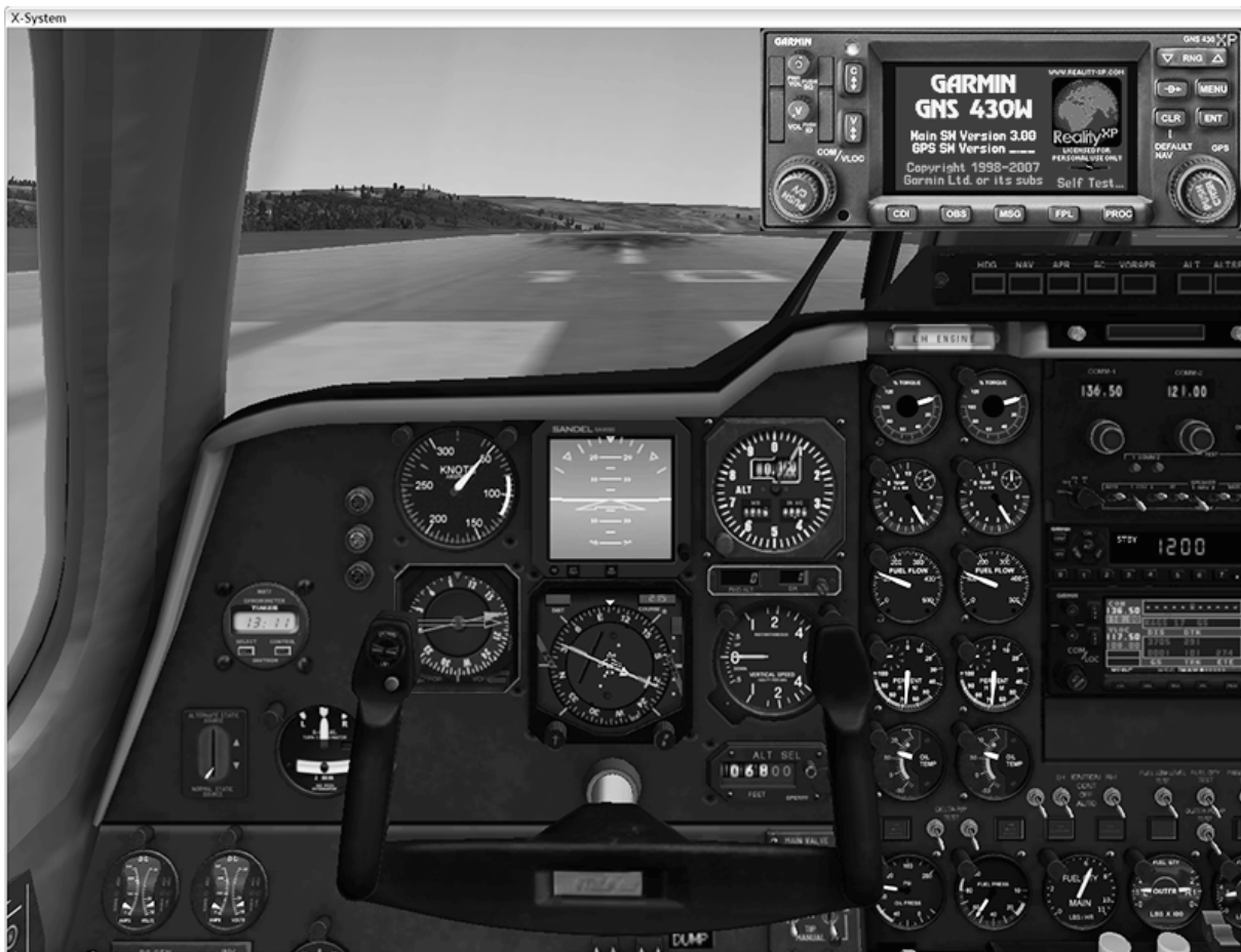
GNS 430 WAAS in the XScenery MU-2 Marquise

The GNS 430W/530W is a comprehensive full-featured radio and navigation stack. The Reality XP GNS simulation is a faithful reproduction that pilots and simmers can use it as a training tool to familiarize themselves with the workings of the actual equipment. Each button and knob is fully functional and performs identically to its real-world counterpart.