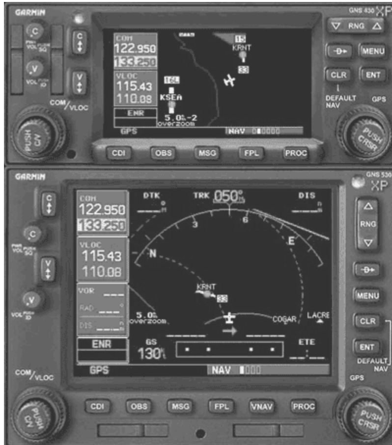
Reality XP GNS 430W/530W Simulation